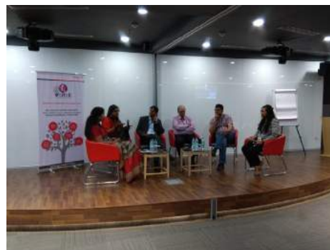
Diversity Hour - Conversations for creating a supportive, inclusive mindset

'Verve' - provides a holistic environment for women employees with no compromises on a safe and respectful workplace. It includes creating an inclusive mindset where we provide support, encouragement and opportunities for women to pursue their career aspirations and a well-balanced life.