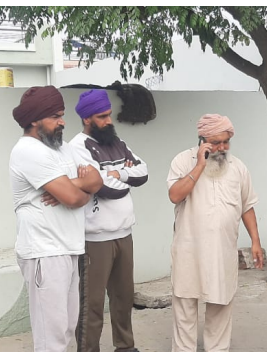
VILLAGE SIRAJ MAJRI, DISTRICT FATEHGARH SAHIB