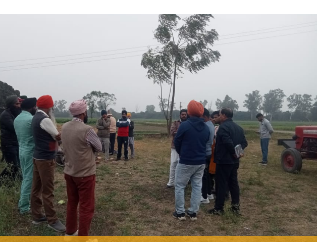
VILLAGE KHALASPUR, DISTRICT FATEHGARH SAHIB

Index: 5 Points - Very High; 4 Points - High; 3 Points - Moderate; 2 Points - Low; 1 Point - Very Low