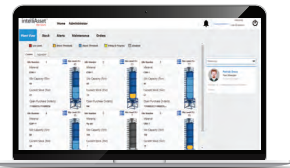
Figure 2: Plant View Dashboard