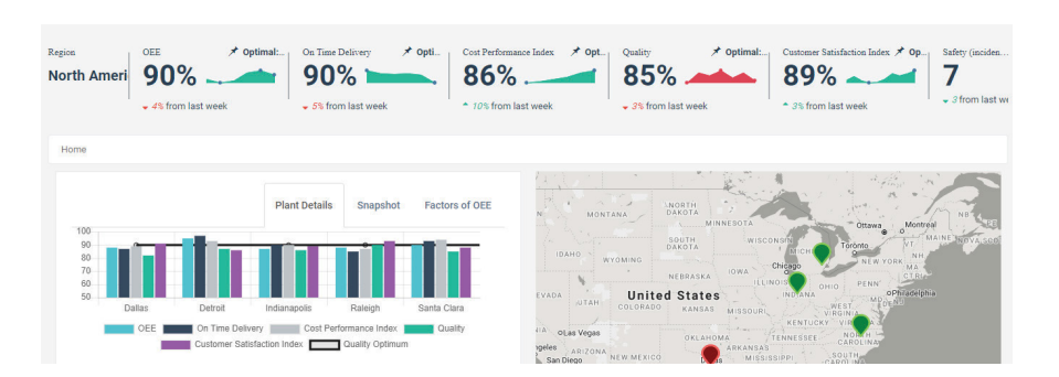
Figure: Dashboard to monitor key performance parameters for plants across multiple geographies

Role-based dashboards providing real-time and contextual information visualization about plant operations across multiple geographies, to help drive accurate actions related to production and quality. intelliAsset for Factories integrates data from multiple plants and machines (vertical integration), and systems (horizontal integration – ERP, MES, BI, EAM, PLM, ES, MM, OM, CRM, Quality, etc) to discover highly actionable information. It does this by identifying data based on specific contexts and correlating them in multiple ways using our proprietary algorithms and technologies such as Machine Learning, AI, etc.